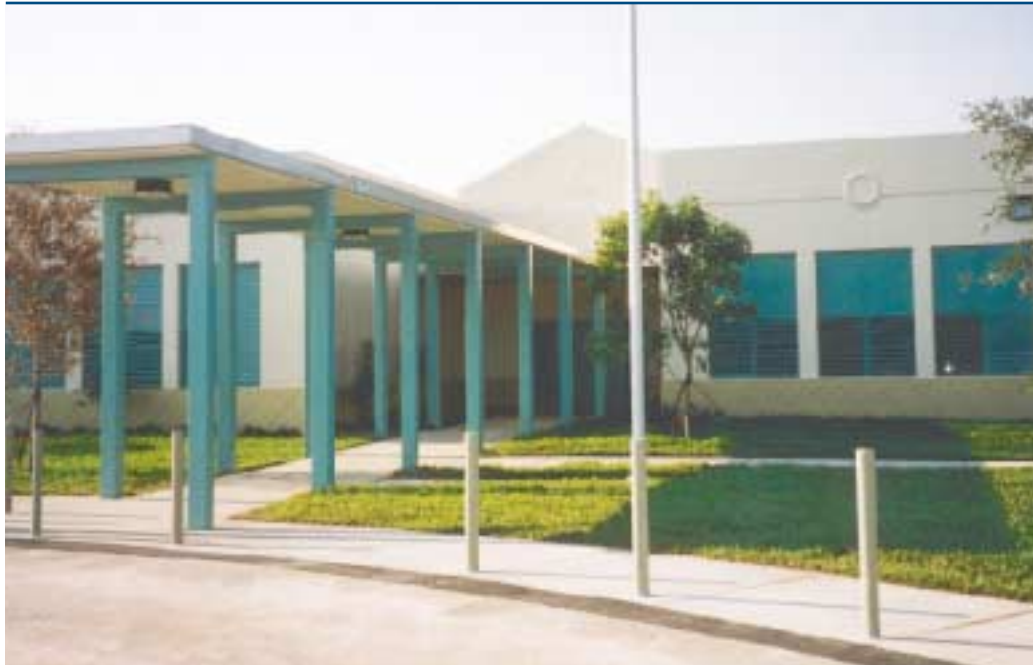
▲ Primary Learning Center, Miami, Florida