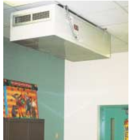
▲ Typical Primary Learning Center classroom incorporating a ceiling-suspended APS-400