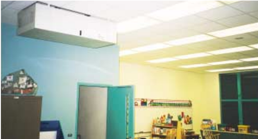
▲ Circul-Aire APS-400 designed for maximum sound attenuation